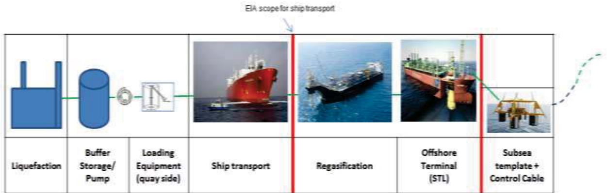
Figure 1 Scope for ship transport

been selected and designed, a complete environmental risk analysis needs to be implemented.